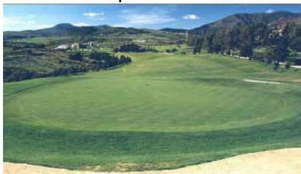
Los Arqueros Golf